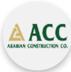
Arabian Construction Co.